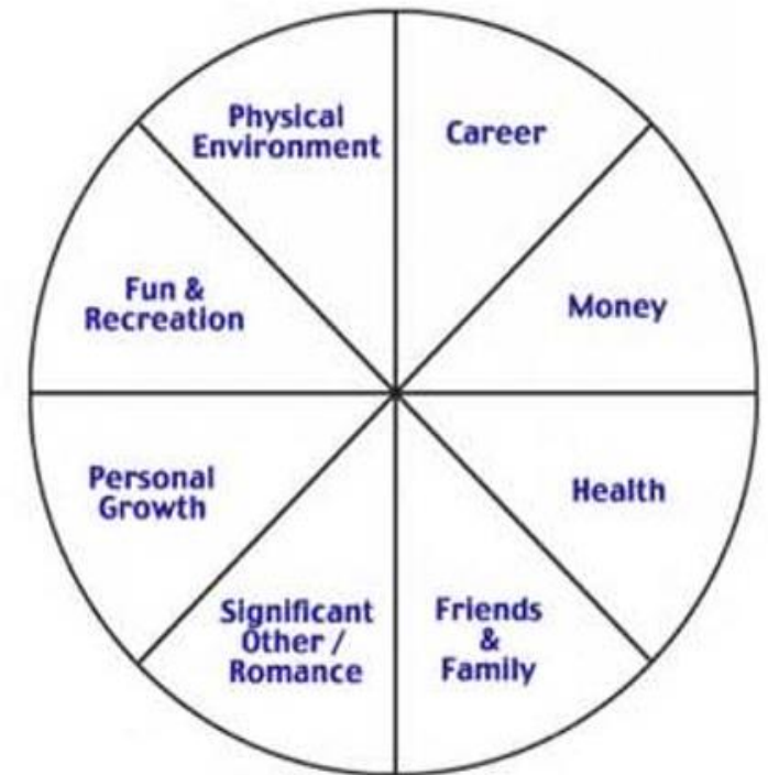
“Wheel of Life”