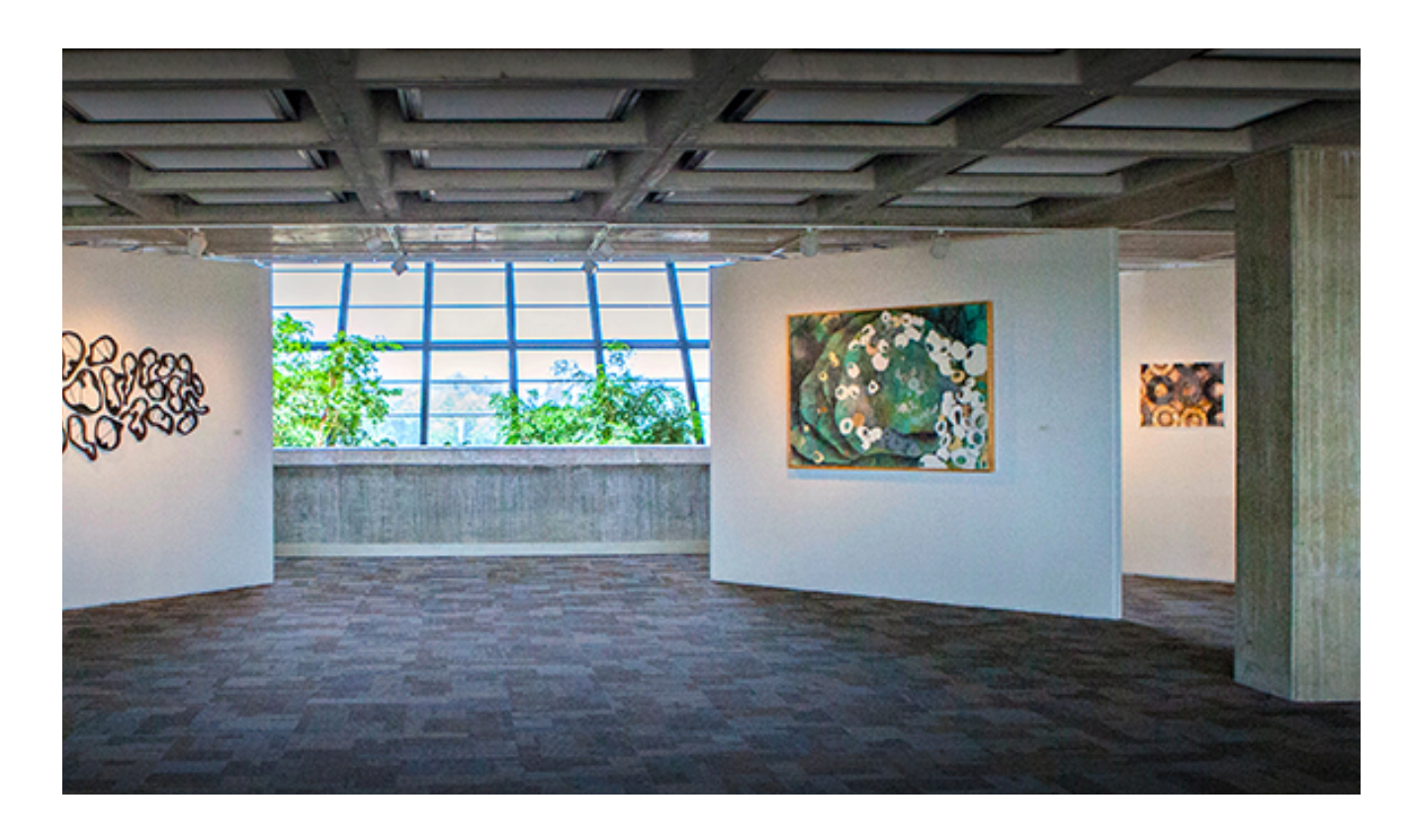
Everyone is welcome to attend!

Biweekly Thursday at 1pm in the 2nd floor Art Gallery