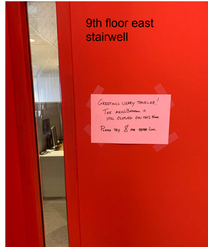
9th floor east stairwell

Anecdotally, the outages last for several weeks (9th floor is out 6 weeks?)