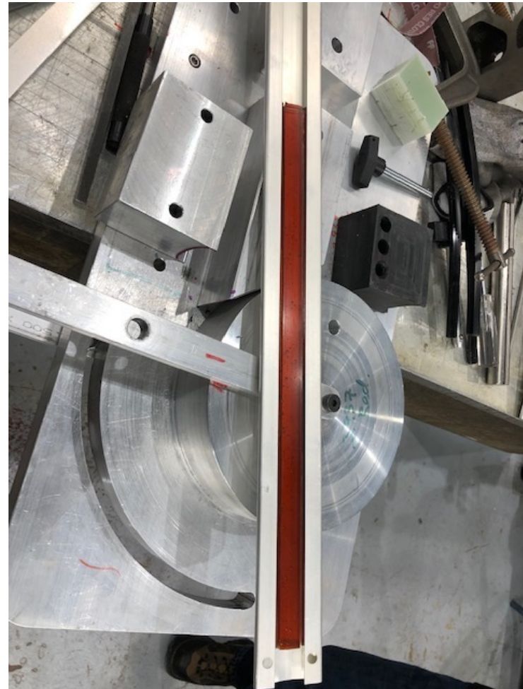
Inserted into profile