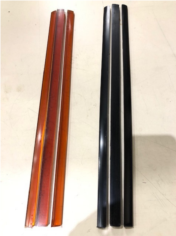
First tests using red inserts

Performed test on our bending machine with the new stiffer inserts