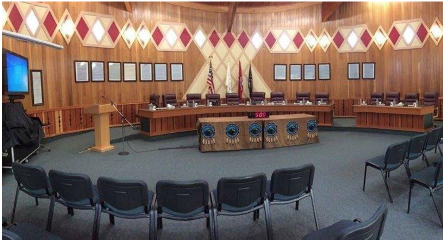
Council chambers of the Confederated Tribes of Grand Ronde in Oregon.