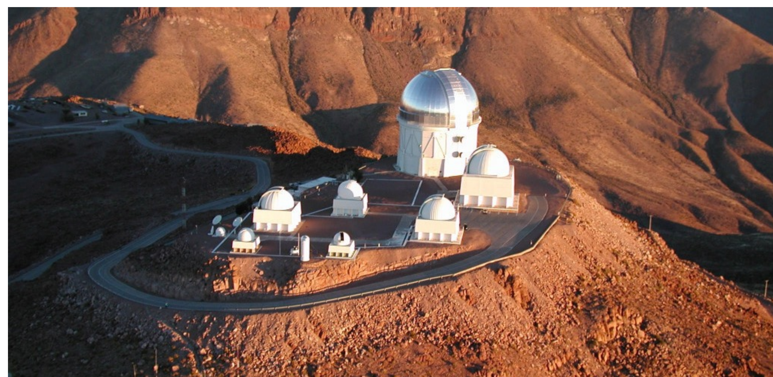
The CTIO, home of the Dark Energy Camera, one of the telescopes used by the DES. https://www.darkenergysurvey.org/the-des-project/instrument/

The Dark Energy Survey collaboration (DES) Gravitational Wave subgroup (DESGW) focuses on searching for optical emissions following gravitational wave detections by the LIGO, VIRGO, KAGRA (LVK) collaboration [2] . DESGW performs such searches using a difference imaging pipeline adapted from the DES single epoch and supernova difference imaging pipelines [1] .