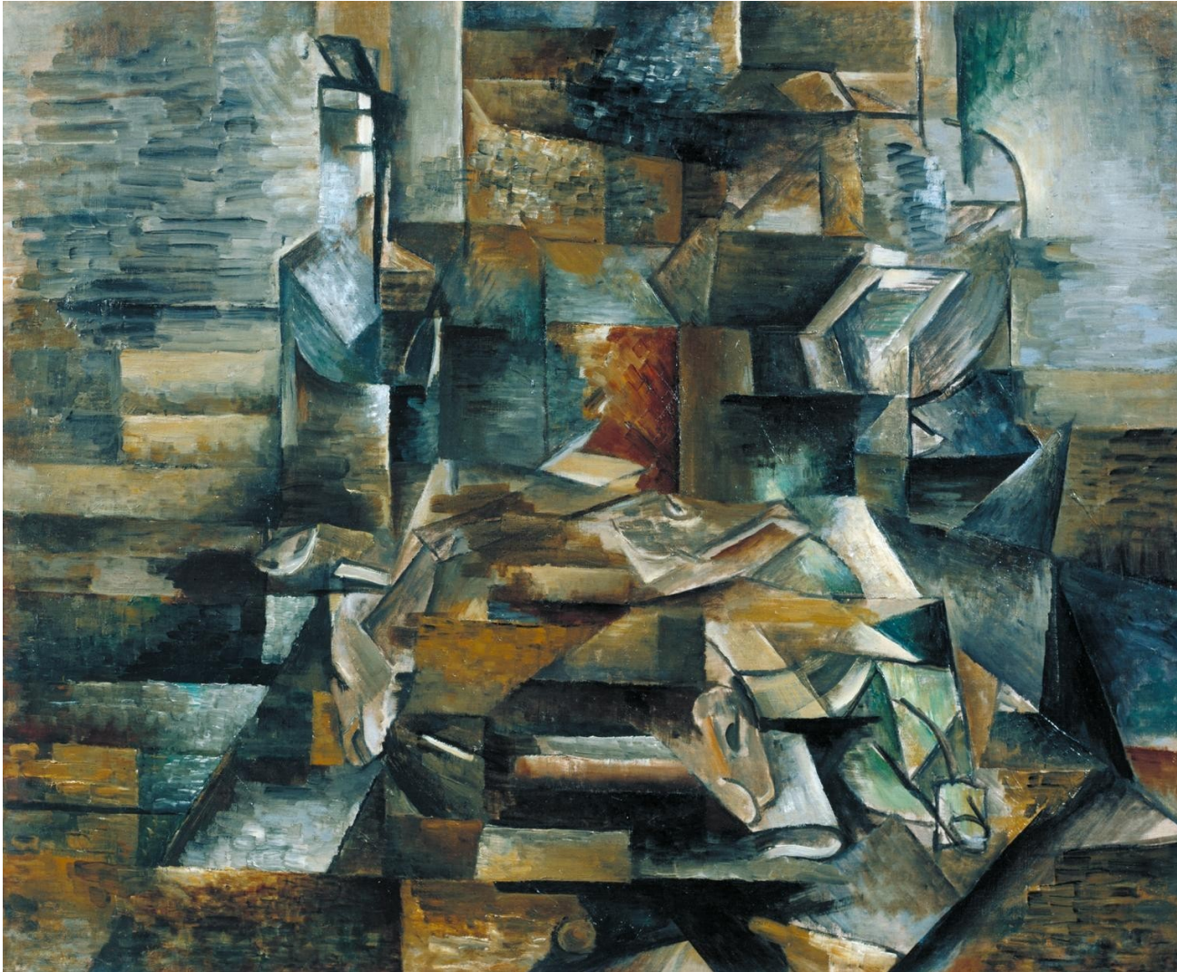
Cubism - Braque's Bottle and Fishes, Paris c.1910-12