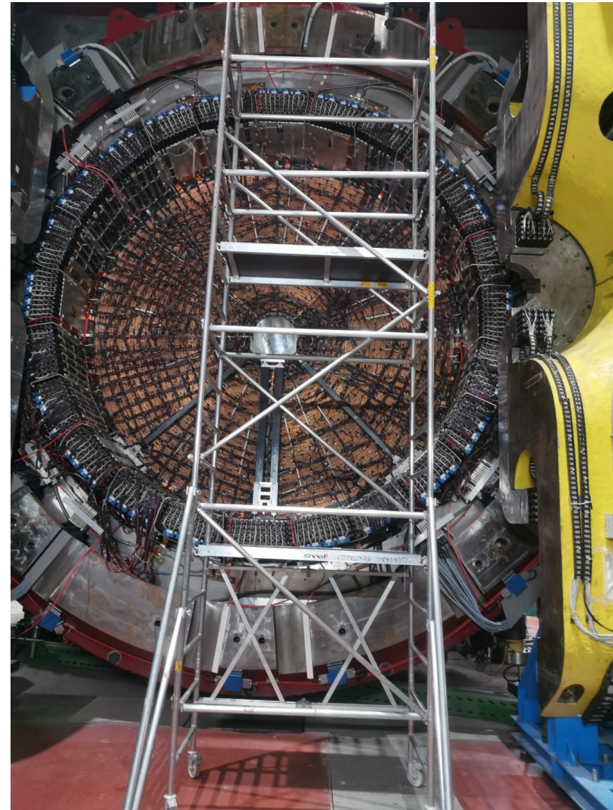
Mount of the scaffold