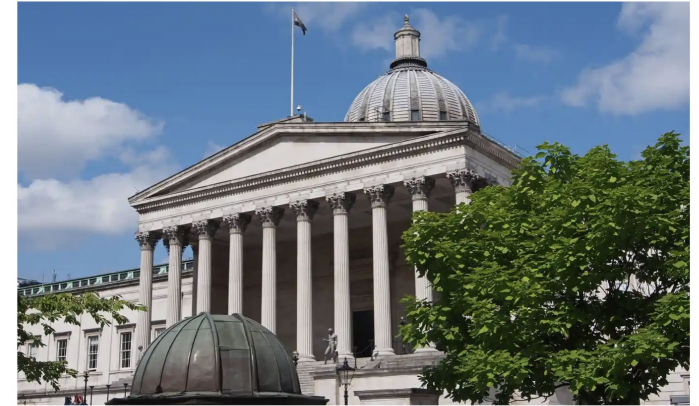
University College London.