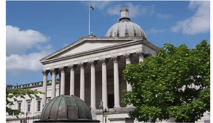
University College London.