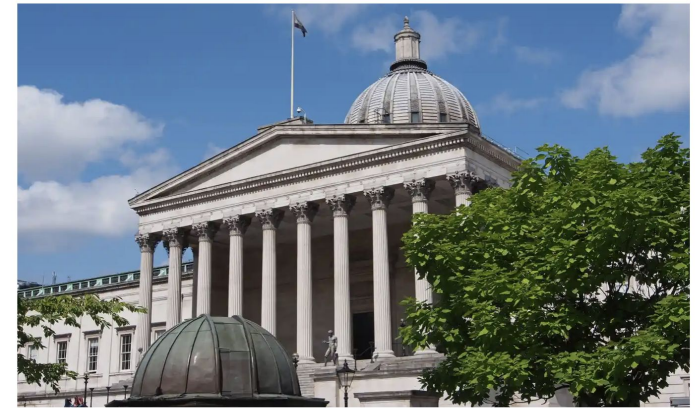
University College London.