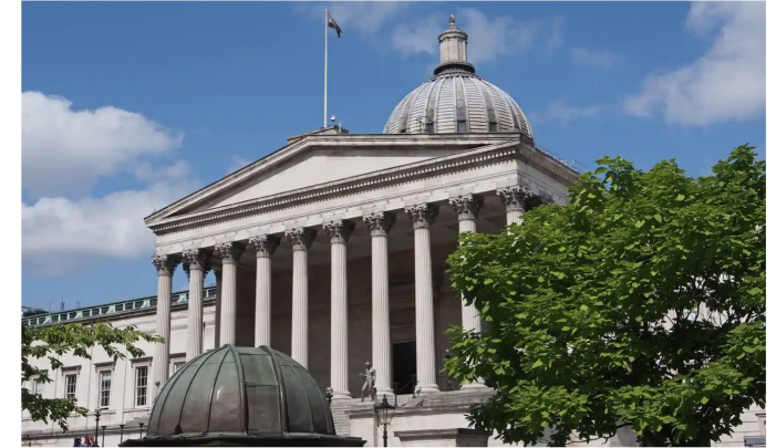
University College London.