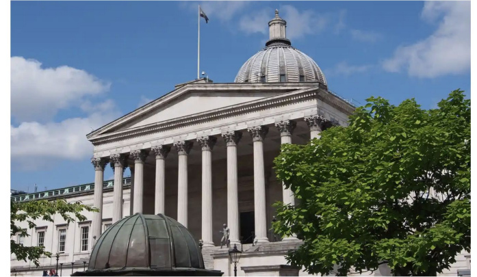
University College London.