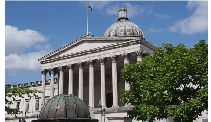
University College London.