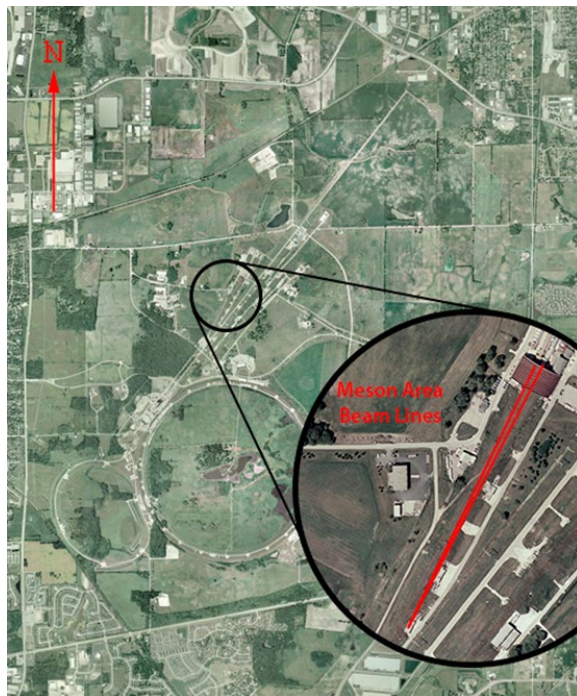
Figure 2. Aerial view of the Fermilab site, indicating the location of the Meson Area.