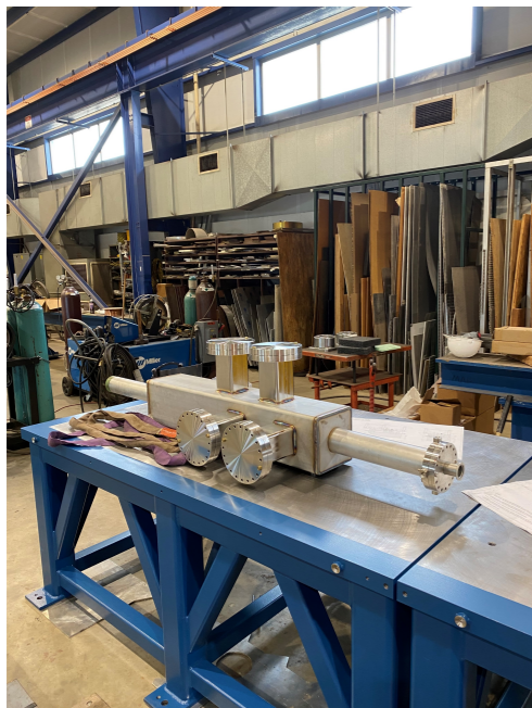
Primary collimator vacuum chamber