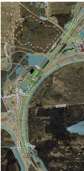
Figure 2. Aerial view of the Fermilab site, indicating the location of the Switchyard fixed target area.