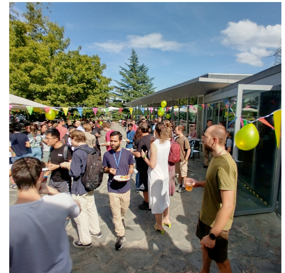
USLUA Summer Party 2023