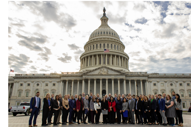
HEP advocates in DC