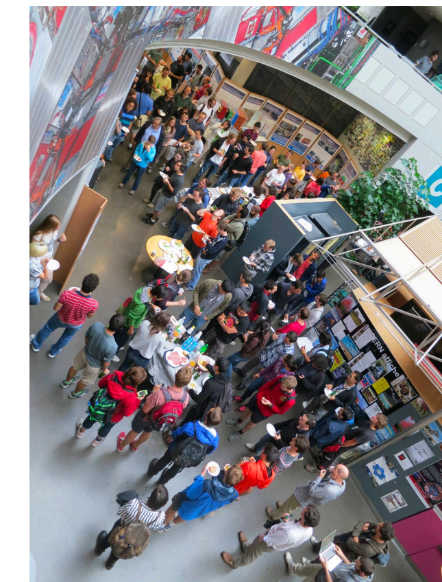
Early-career networking event at CERN