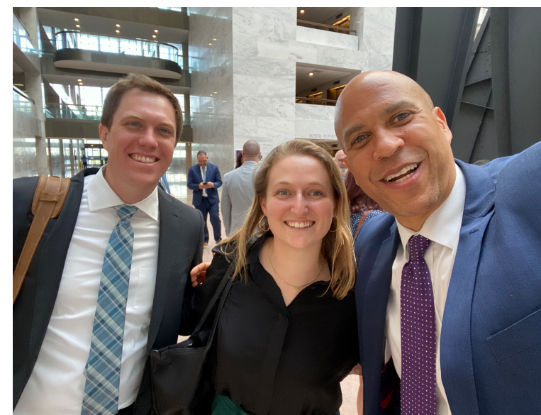
USLUA members with Senator Booker