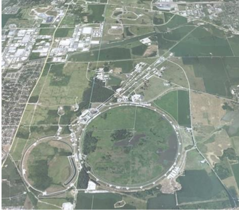
Figure 2. Aerial view of the Fermilab site.

VI that may from time to time contain radioactive materials. These areas comprise many different locations on the Fermilab site including accelerator areas, beam line areas, Wilson Hall, and the Village. Radiation Physics Form 85 (R.P. Form 85), List of Facilities Containing Radioactive Material , [3] identifies facilities that are permitted to store and use radioactive material.