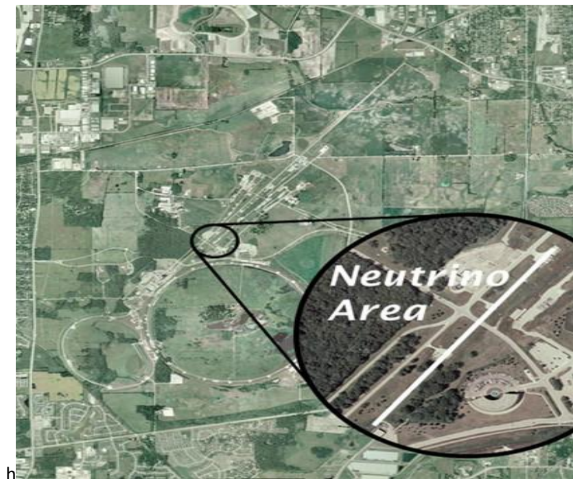
Figure 3. Aerial view of the Fermilab site, indicating the location of the Neutrino Area.

The Neutrino Area is located in the central campus on the Fermilab site.