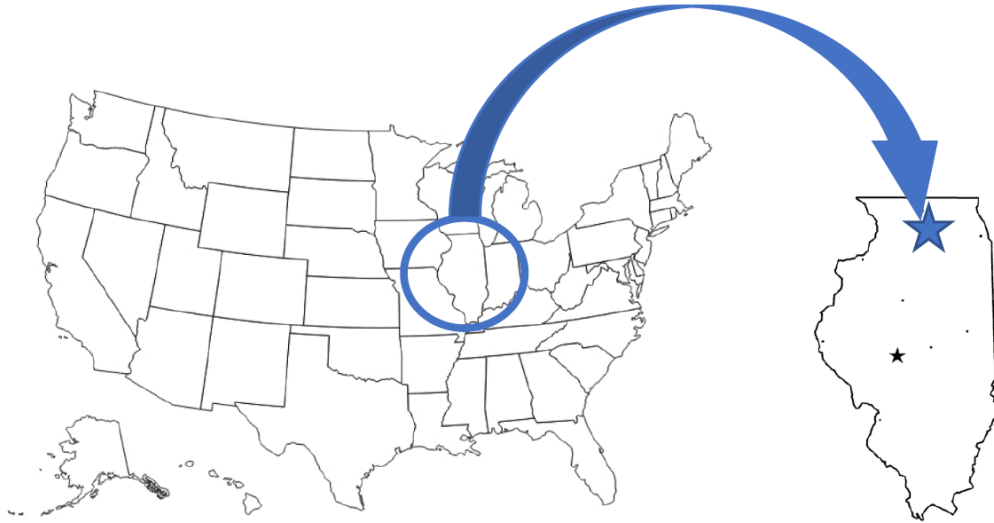
Figure 2. Regional view showing the location of the Fermilab site in Batavia, IL.

The Neutrino Area is located on the Fermilab site in Batavia, IL.