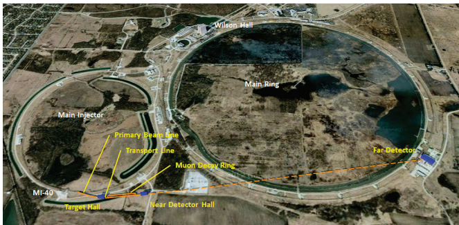
Figure 1 Schematic layout of nuSTORM on Fermilab site.