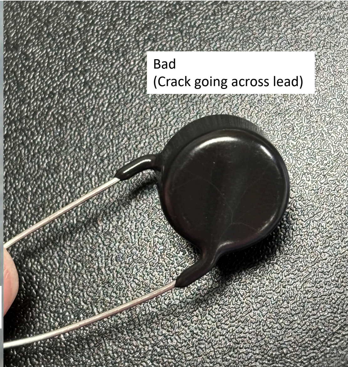
Bad (Crack going across lead)