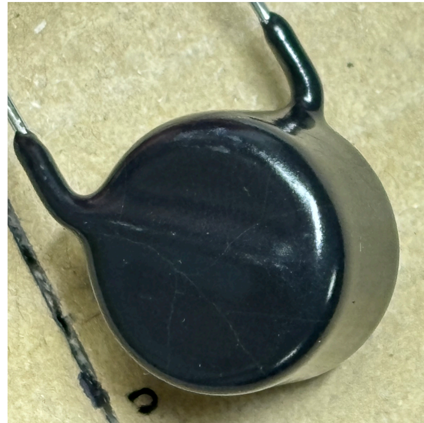
Bad (Crack going across lead)