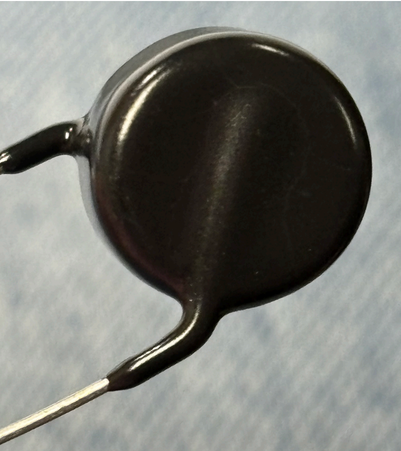
Bad (Crack going around lead area on MOV)