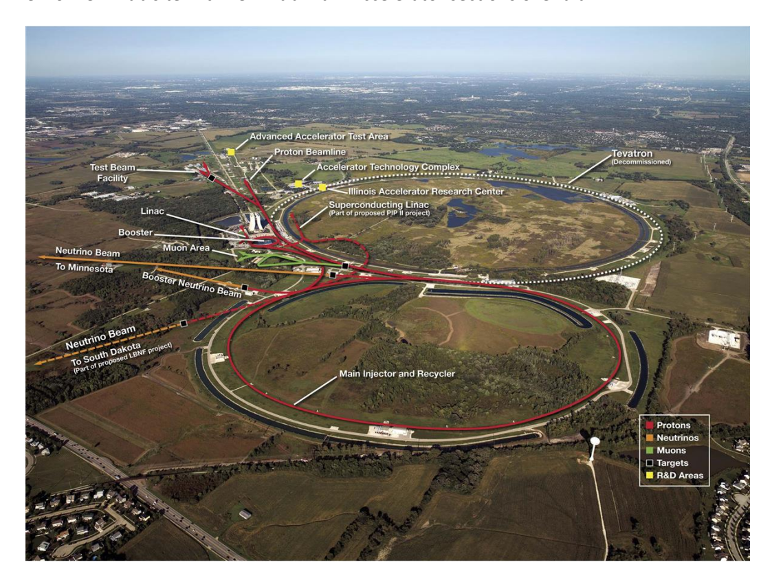
Figure 2. Aerial View of Fermilab Showing Fermilab Main Accelerator.

Aerial view of Fermilab site with Fermilab Main Accelerator sections overlaid.