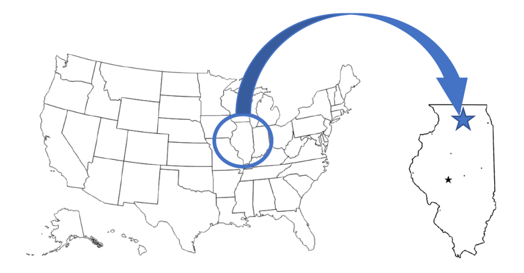
Figure 1. Regional view showing the location of the Fermilab site in Batavia, IL.

The VTS accelerator is located in the central portion of the site, in the Industrial Building complex.