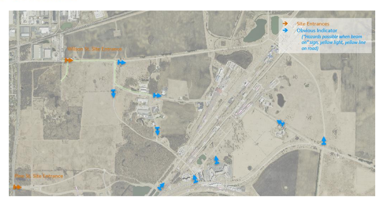
Figure 5. Location of Obvious Indicators

Fermilab Security routinely patrols the Fermilab Batavia, IL site and challenges potential unauthorized access.