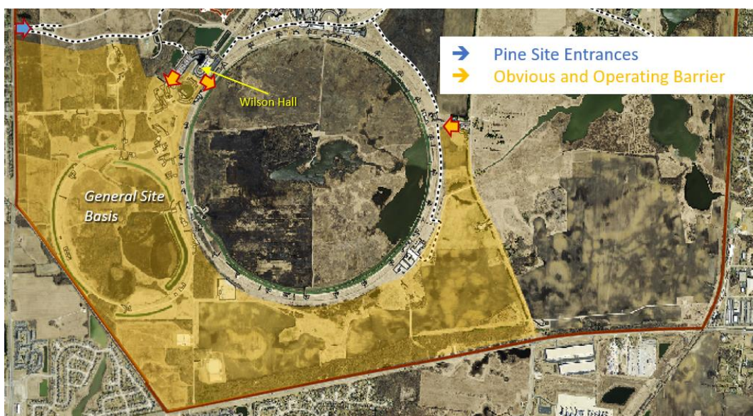
Figure 4. Location of Obvious and Operating Barriers.

Obvious Indicators are in use to notify individuals of access requirements and restrictions beyond the location of the Obvious Indicator. The Obvious Indicators utilize signage, lights, and painted road lines to alert and notify personnel. These Obvious Indicators are in place surrounding several operational segments and experimental areas of the Fermilab Main Accelerator: