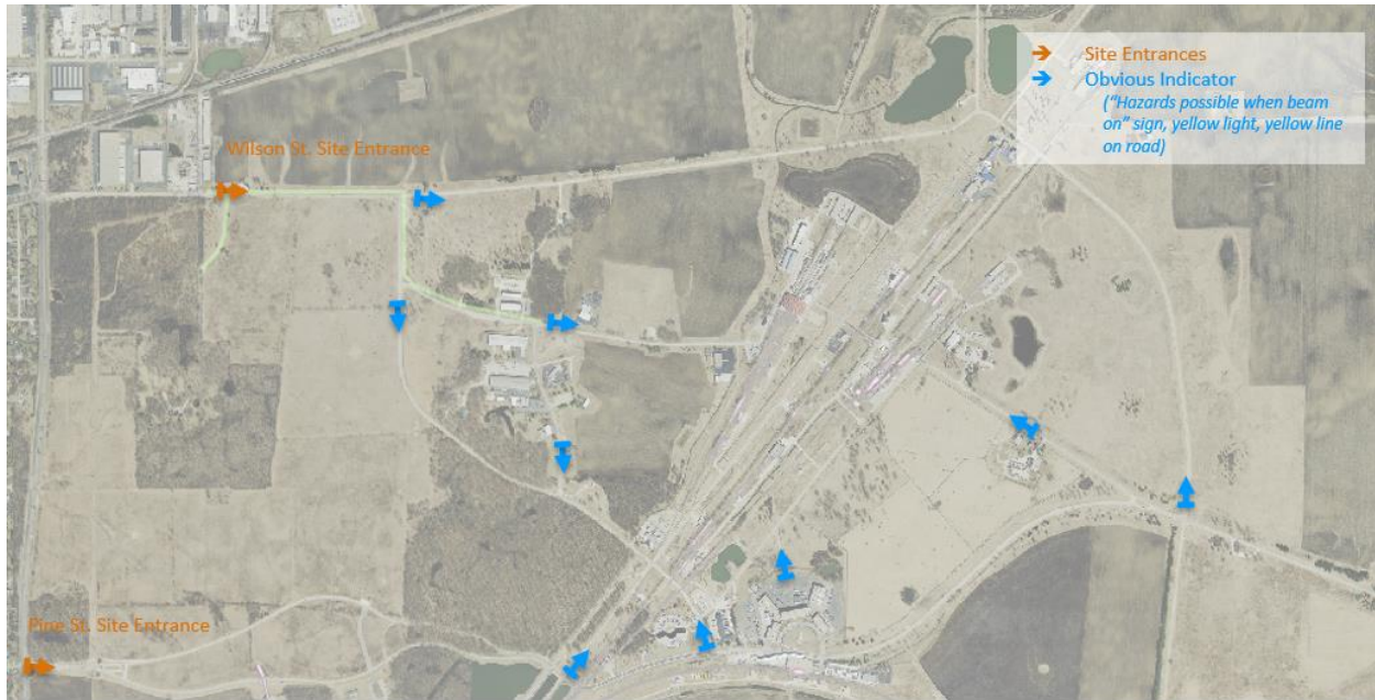
Figure 5. Location of Obvious Indicators

Fermilab Security routinely patrols the Fermilab Batavia, IL site and challenges potential unauthorized access.