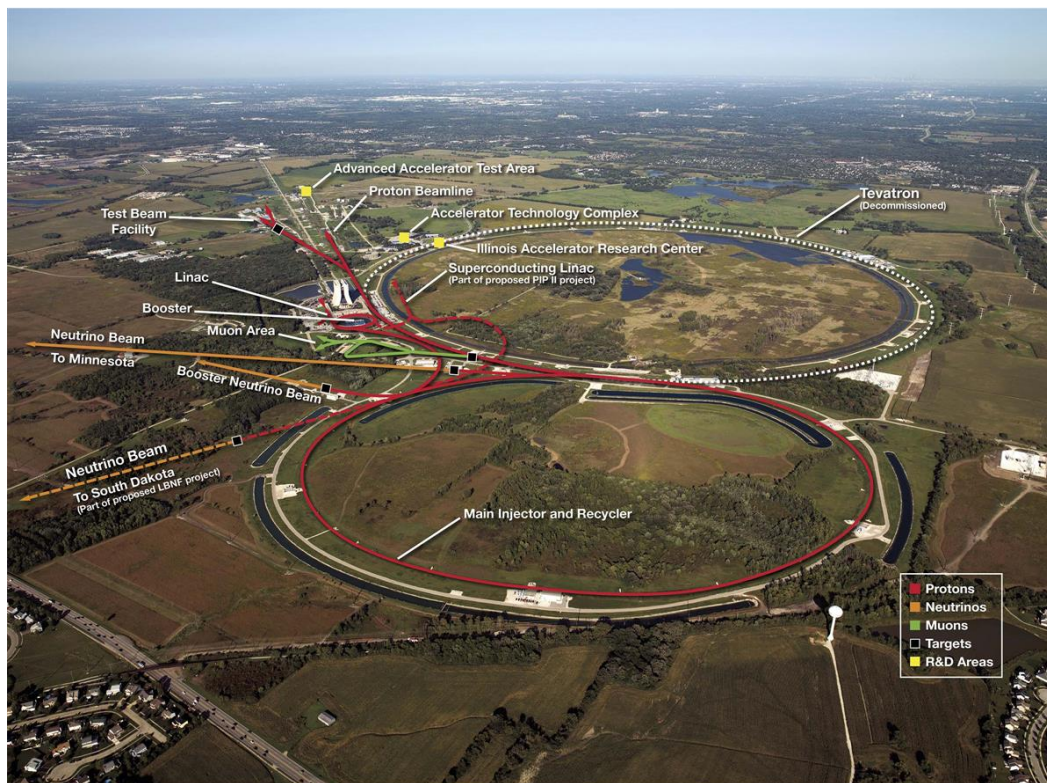
Figure 2. Aerial View of Fermilab Showing Fermilab Main Accelerator.

Aerial view of Fermilab site with Fermilab Main Accelerator sections overlaid.