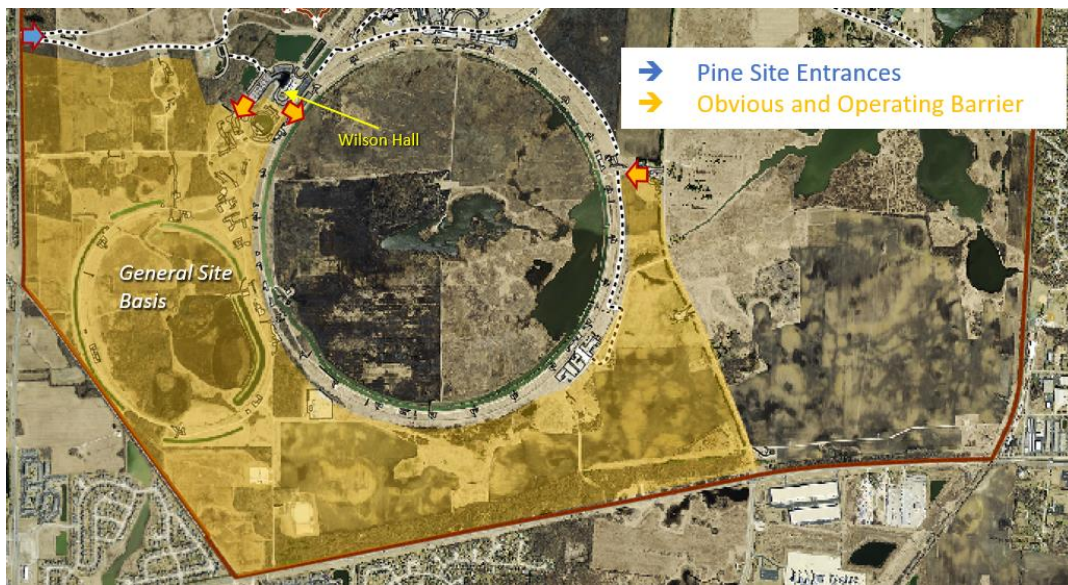
Figure 4. Location of Obvious and Operating Barriers.

Obvious Indicators are in use to notify individuals of access requirements and restrictions beyond the location of the Obvious Indicator. The Obvious Indicators utilize signage, lights, and painted road lines to alert and notify personnel. These Obvious Indicators are in place surrounding several operational segments and experimental areas of the Fermilab Main Accelerator: