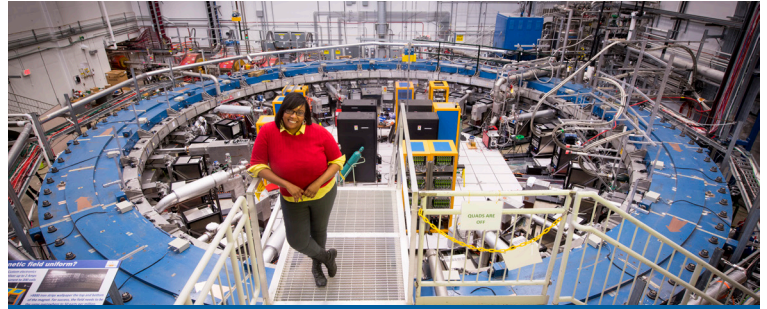
Muon g-2 scientists have found strong evidence for new physics. Muons don't behave as predicted and might interact with hidden forces.