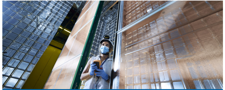
Scientists have built this prototype particle detector for the international Deep Underground Neutrino Experiment. The final detector modules, to be built in South Dakota, will be 20 times larger than this prototype.