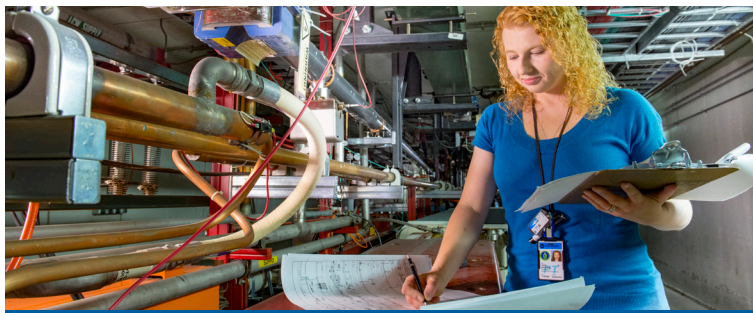
Fermilab operates the second-largest particle accelerator complex in the world. The Main Injector produces the world's most powerful neutrino beam.

Researchers at Fermilab are leaders in artificial intelligence and machine learning for particle physics, using AI and ML to analyze big data sets and improve sensors operating in extreme environments.