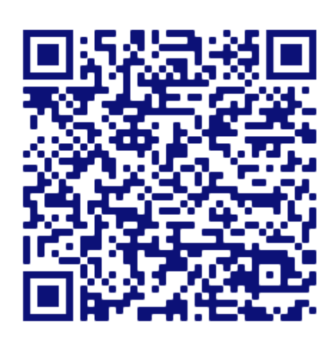
QR Code to latest Funding Opportunity Announcement