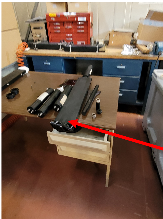
scintillators for cosmic ray trigger