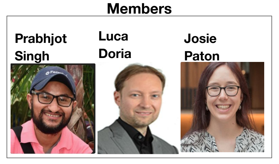
Member representatives from major experiments: (T2K, NOvA, MINERvA, MicroBooNE, SBND, ICARUS, DUNE, and electron scattering)