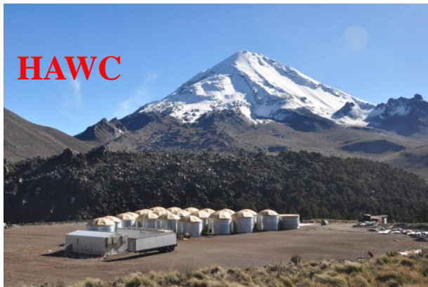
August 1, 2013