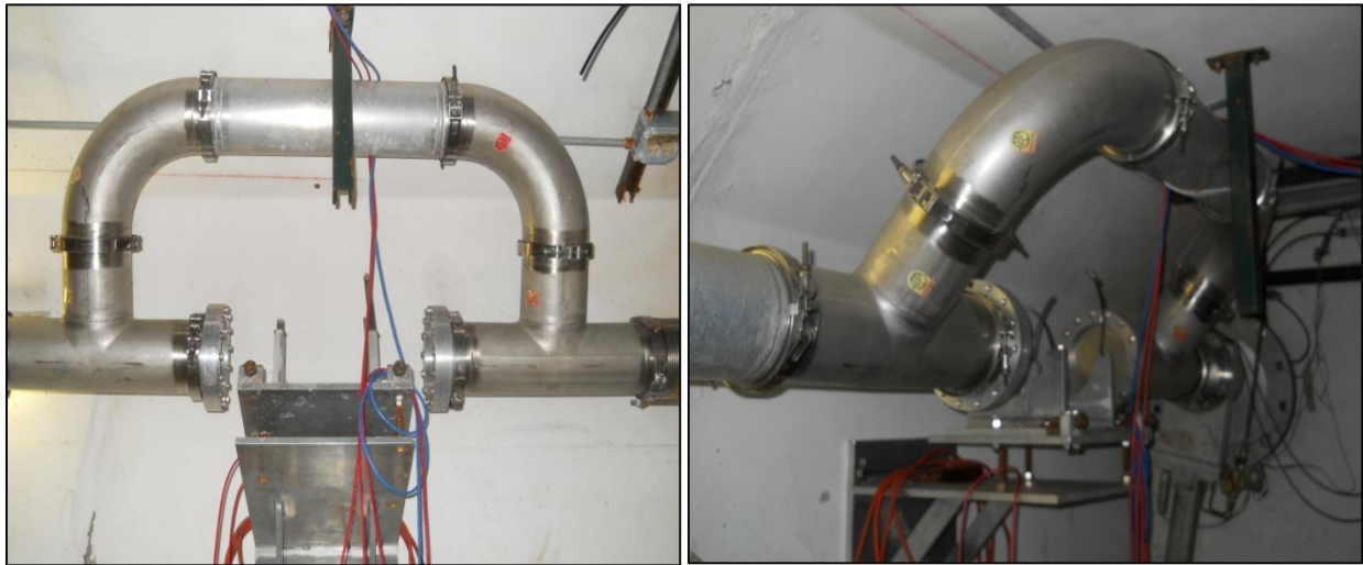
Figure 4 Example of Vacuum bypass line for continuous vacuum with an air gap

In order to make room for this detector table we need to replace the 6 feet between the two quadrupole magnets with an air gap large enough for the table but minimize unnecessary beam loss. The space between the quadrupoles will then have a vacuum bypass line to have continuous vacuum around the table. Shown in Figure 4 is an example of such vacuum bypass line.