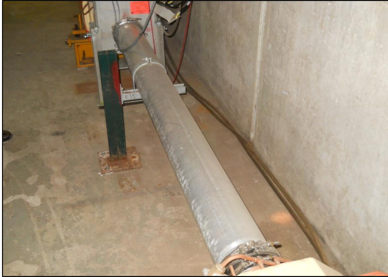
Figure 2 Upstream section of M03 looking downstream