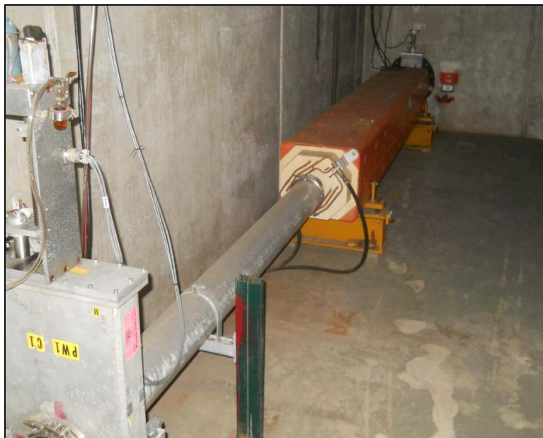
Figure 1 Upstream and downstream section of MT3. The 6 feet of 6" beam pipe will be adapted for a moveable table

MT3 has two sections, upstream and downstream. The upstream section is approximately 50 feet of enclosure that is comprised of two quadrupole magnets one vertical trim magnet and a pinhole collimator. There is one bayonet style SWIC between the two quadrupole magnets that are spaced apart by 6 feet. Figure 1 and 2 show images of this upstream section and the proposed area for a detector table.