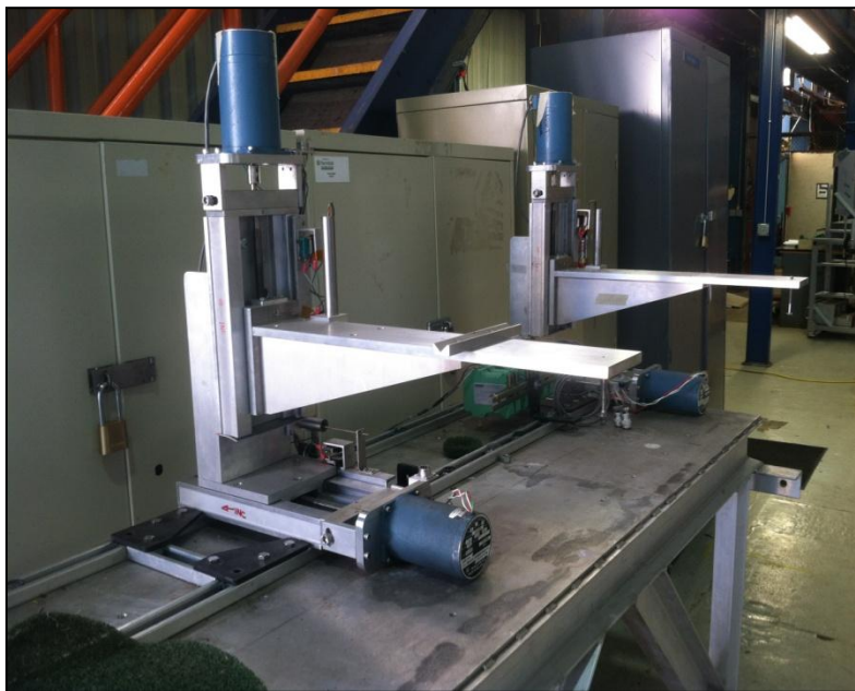
Figure 3 Actual detector table

The detector table is 4 feet long with transverse motion relative to beam trajectory. Shown in Figure 3 is a similar table proposed. With the table mounted to the floor, the maximum vertical adjustment is 6 inches. The beamline itself is 12 inches above the floor. Therefore the table cannot physically be in the path of the beam. The horizontal movement range is also 6 inches. Therefore we will position the table so the motor drives stay away from the beam trajectory if the table is driven inwards. Both movements transversally have physical motion stops and limit switches built in.