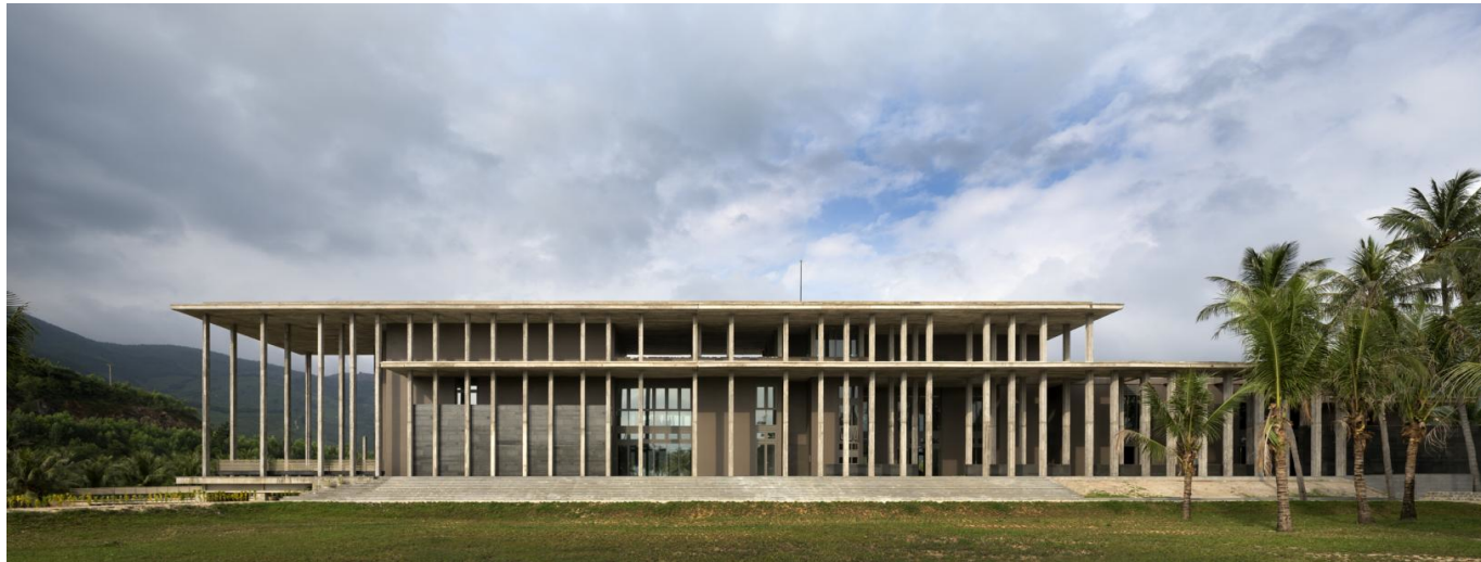
ICISE Center: view from the sea