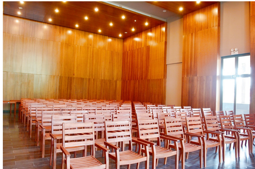
Conference room 120 seats