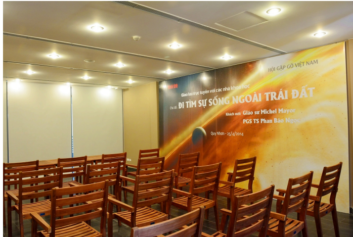
Seminar room 25 seats