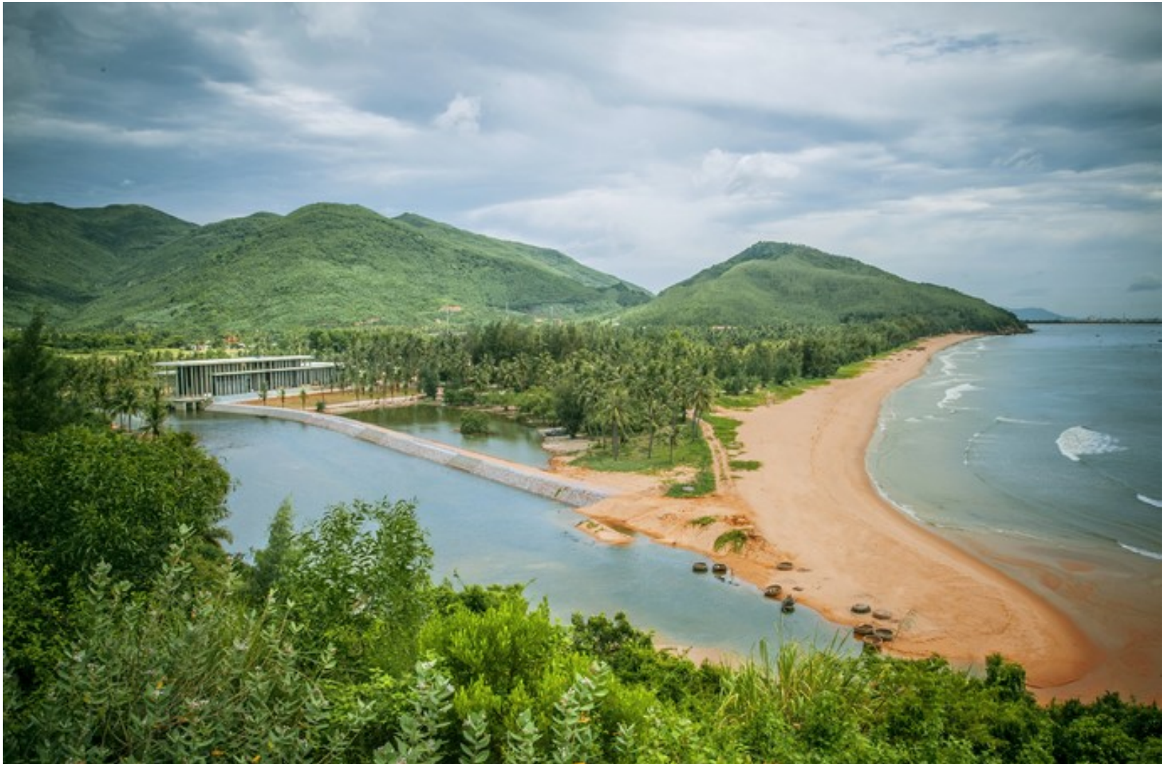
ICISE Center, Quy Nhon, Vietnam